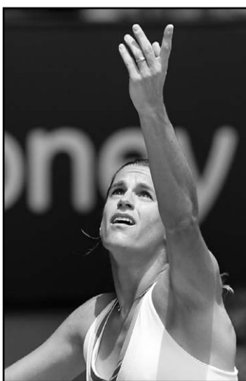
Amelie Mauresmo serves during her first round match against Shenay Perry at the Australian Open in Melbourne on Monday.

Garcia-Lopez was 1-1 with Joachim Johansson when the 6-