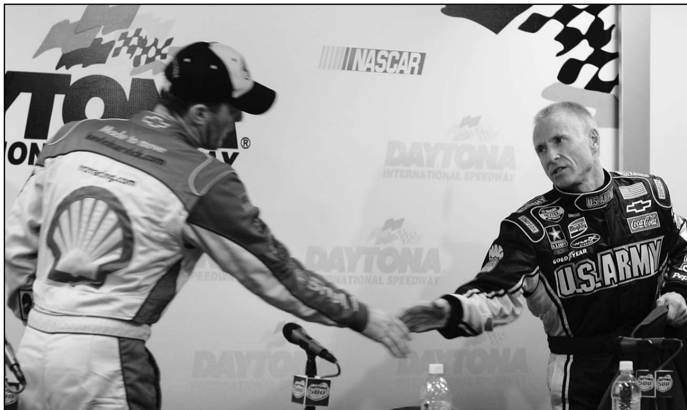
Race winner Kevin Harvick, left, and second-place finisher Mark Martin shake hands at a news conference following the NASCAR Daytona 500 in Daytona Beach, Fla.

"I'm really thankful to be here," Waltrip said before the race. "A lot of times you for-