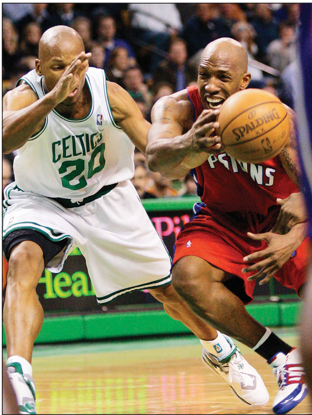
Detroit Pistons' Chauncey Billups, right, loses control of the ball and is fouled as he drives against Boston Celtics' Ray Allen during the second half in Boston. The Celtics beat the Pistons 90-78.