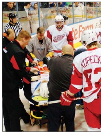
Medical staff attend to Detroit Red Wings right wing Marian Hossa as he lies on a stretcher before being taken off the ice during the first period at St. Louis.

The Red Wings were short-handed for six minutes near the end of the first period, yet took the lead while holding the Blues to two shots. Kopecky scored his third goal in five games and fifth overall off the rebound of a shot by Pavel Datsyuk when he swept a backhand around a prone Mason at 14:54.