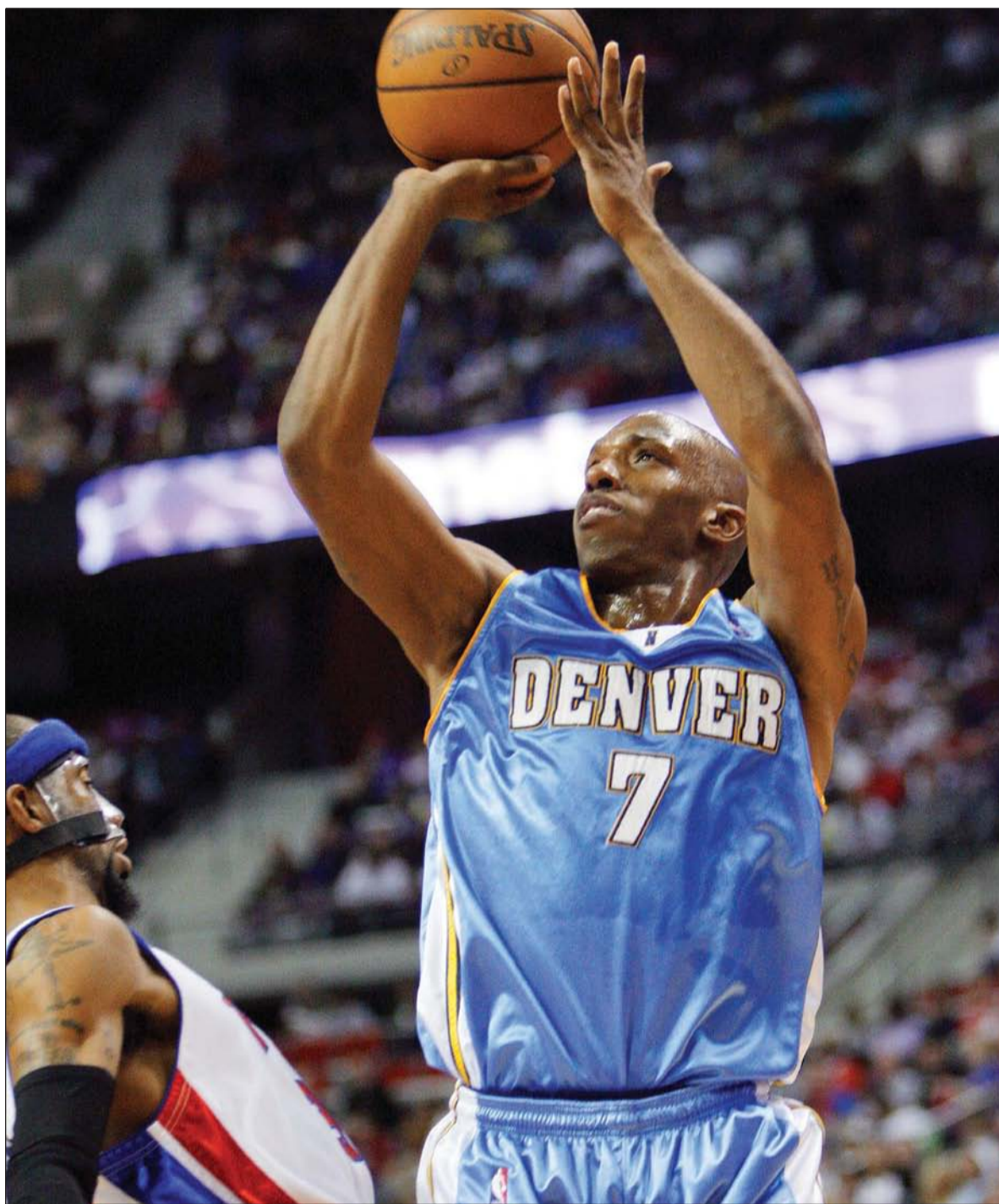
Denver guard Chauncey Billups shoots over his longtime pal Detroit guard Richard Hamilton in the first quarter at The Palace. Billups returned to Auburn Hills to play against his former team for the first time.

With their first home win in nearly a month — they had lost four straight here — the Pistons are back over .500.